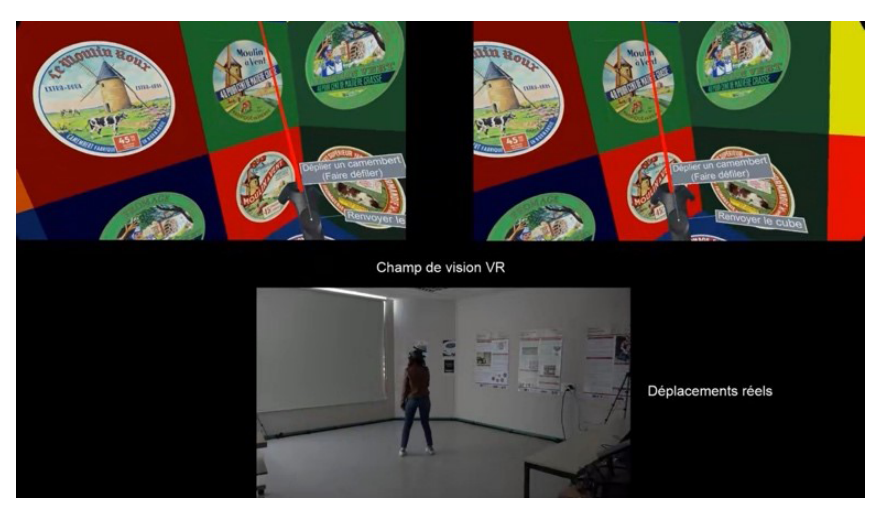
FIGURE 2. VIDEO TRACKS

during his virtual journey, particularly when confronted by the simulation's<sup>4</sup> chaperone. Video capture also enables us to transcribe a posteriori the movements and sometimes highly instructive informal verbalizations ("thin", "oops", laughter) produced by the co-participants. As shown in Figure 2, For their processing, we represented the videos by rendering the co-participants' stereoscopic field of view resynchronized at the top with the outside viewpoint filmed from the rear-left corner of the room where the experiment took place. This gave us 22 videos formatted as follows: