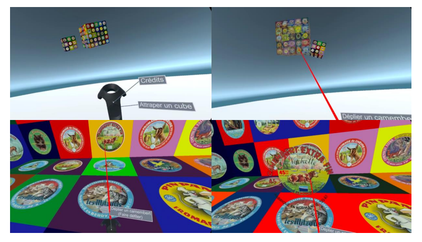
FIGURE 1: VIRTUAL REALITY DEVICE ILLUSTRATIONS (1) TOP LEFT, (2) TOP RIGHT, (3) BOTTOM LEFT, (4) BOTTOM RIGHT

The system studied was designed as part of the CPER/FEDER NUMERIC action Archives Augmentées program, directed by Jean-Marie Dallet, Frédéric Curien and Charles-Alexandre Delestage. The action was based on the exploitation of the Garnaud collection at the Musée du Papier d'Angoulême, which includes camembert labels printed by the Bardou-Le Nil factories during the 20th century. The labels were digitized and cut into layers representing the different parts of the label from an iconographic point of view. The entire collection is grouped into categories based on the label's theme (famous people, mills, monks, etc.). Each theme is then distributed over the facets of a cube analogous to the famous Rubik's Cube, whose size varies dynamically according to the number of labels in the collection. The colored background of the facets varies randomly according to a predefined palette, inspired by the work of Vasarelli. As shown in Figure 1, All these cubes float around the user in space (1) and can be selected by the user for consultation. At this point, the cube becomes translucent (2) and is placed around the user, metaphorically bringing the latter into the cube (3). The user can then choose to unfold the iconographic layers of labels to view them in the space of the cube (4). Alternatively, they can return the cube and select another for consultation.